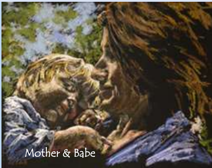
Mother & Babe